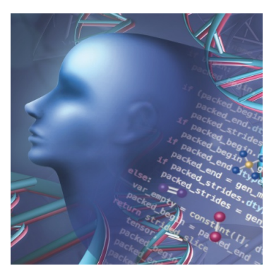
Artificial Intelligence in Oncology Symposium: Precision Medicine and Cancer Disparities VIRTUAL EVENT Case Comprehensive Cancer Center