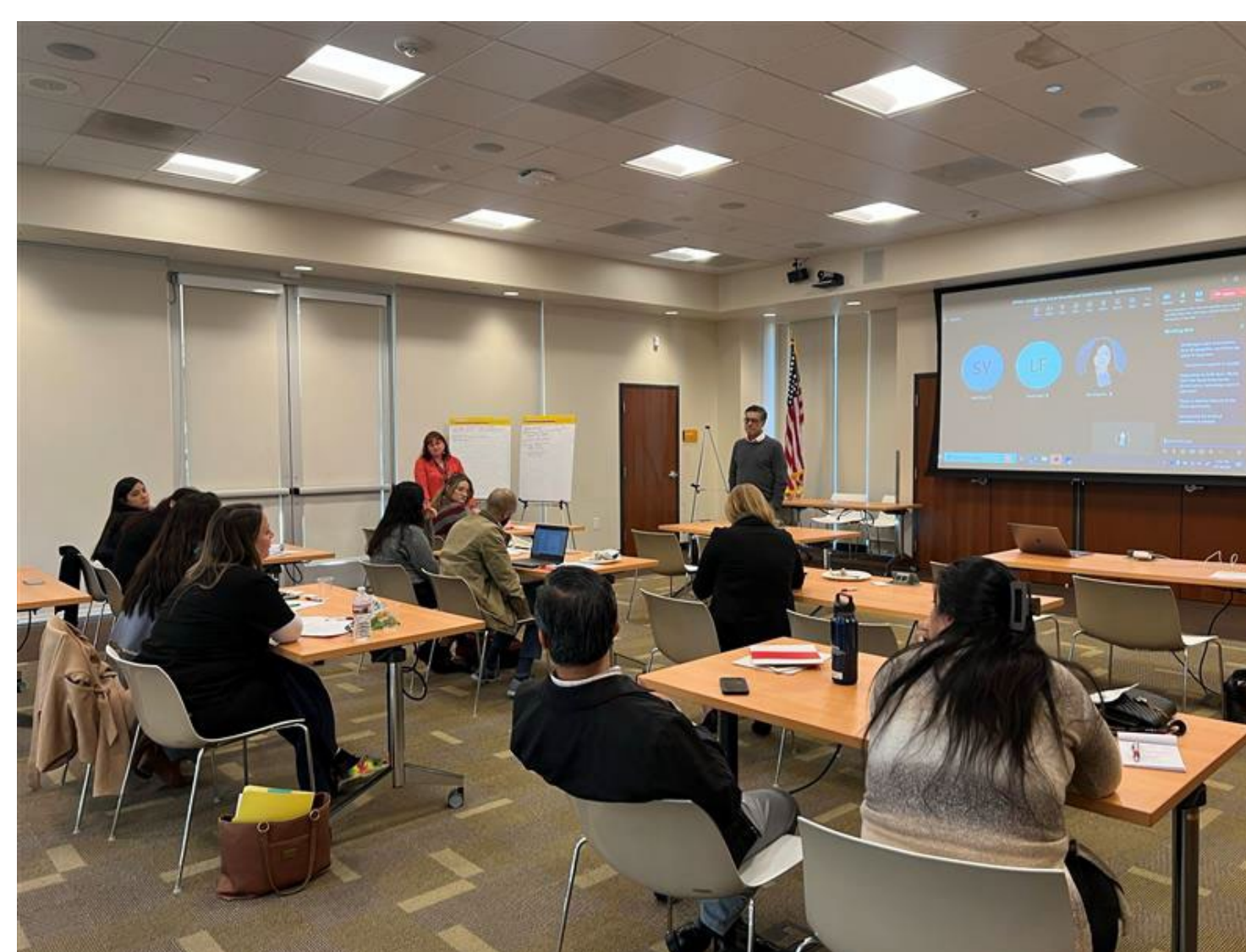
Figure 2. Sharing data and receiving input from Antelope Valley Health Equity Partnership with Cedars-Sinai Community Outreach and Engagement