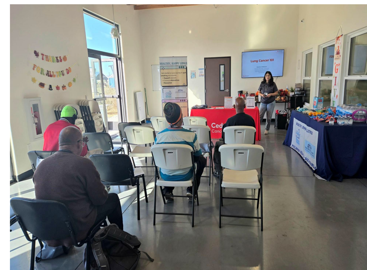
Figure 3. Community outreach education sessions and collecting survey data from participants