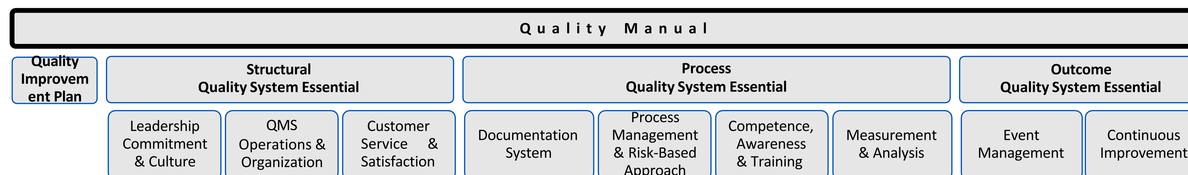
Figure 3. Quality Management System based on ISO 9001:2015, organized by quality system essentials (QSEs)